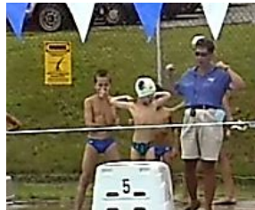
Every Olympic swimmer's journey started as a kid... (www.swimtoday.org)