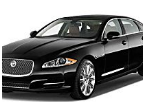
10 Dangerous Car Brands Everyone is Driving (DailyForest)