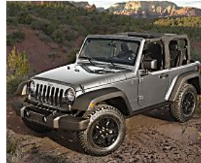
2016's Top 10 New Cars (Kelley Blue Book)