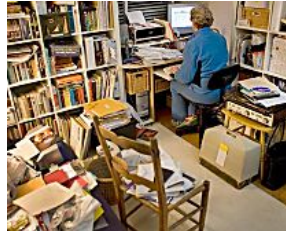
Downsizing? Ditch These 12 Items (AARP)